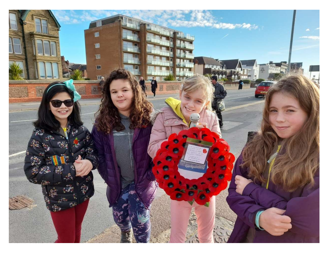
Photograph with parental permisssion