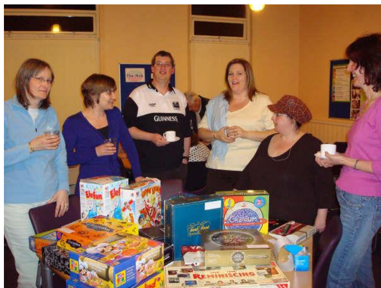
First ACTIV8 Table-Top Games Evening: March 2008

Just to prove we did this before, below is a picture from our first table-top games evening in 2008. Almost all the same people; almost all the same games. Looking forward to seeing you again at the next games evening!